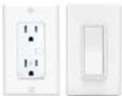
Spectre receptacle and switch

Spectre receptacles and switches are an easy-to-install option for wireless or wired control. Lamps and other receptacle-based lighting can be controlled seamlessly via a wall switch, or automatically based on occupancy logic – which makes for easy California Title 24 compliance.