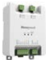
PC50X DALI module

DALI (Digital Addressable Lighting Interface) enables fine control of dimming and light color, as well as exceptional white-tone control. With up to 64 fixtures and 16 groups or scenes scenes at your command, a whole world of lighting options open up to transform your guestroom.